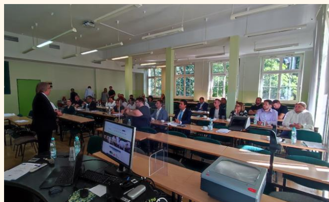
Fig. Lecture room and audience during the training

After some time (at least 6 months), the participants were asked if it was easier for them to implement the biosecurity measures after following the implementation of the SM.